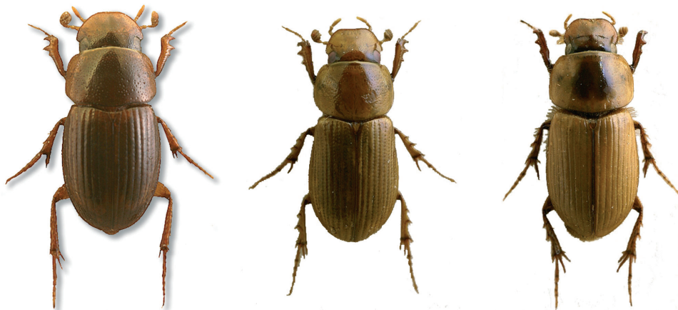
Figs 1-3. Habitus. 1. Aphodius (Coptochiroides) laotianus sp. n., 2. A. (C.) subcostatus (Kolbe) (China, Yunnan pr., Lijiang), 3. A. (Bodilus) saoudi (Paulian) (Saudi Arabia, Hieth)

Elytra shagreened though still somewhat shining. Scutellum narrow, triangular, sides arcuate, surface with two punctures near base. Elytral grooves narrow, punctures of grooves rather fine,