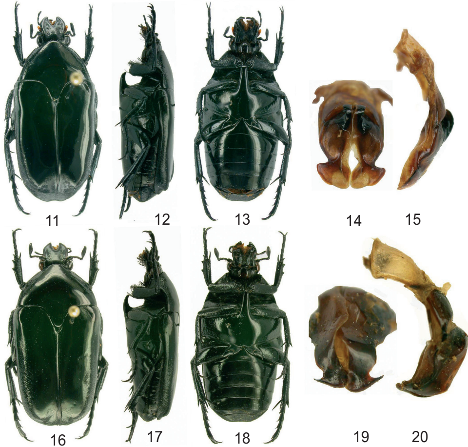
Figs 11-20. Thaumastopeus inexpectatus glabratus ssp.n.: 11- habitus dorsal aspect; 12- habitus lateral aspect; 13- habitus ventral aspect; 14- aedeagus; 15- aedeagus lateral aspect. Thaumastopeus saleijeri Schauer, 1939: 16- habitus dorsal aspect; 17- habitus lateral aspect; 18- habitus ventral aspect; 19- aedeagus; 20- aedeagus lateral aspect.

Distribution. Philippines, Leyte Island, Mt. Balolacue.