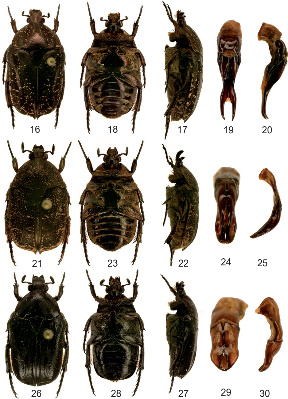
Figs 16-30. 16-20. Protactia (Pseudourbania) porloyi sp. n.: 16- habitus dorsal aspect; 17- habitus lateral aspect; 18- habitus ventral aspect; 19- aedeagus; 20- aedeagus lateral aspect. 21-25. Protactia (Netociomima) adspersa moluana ssp. n.: 21- habitus dorsal aspect; 22- habitus lateral aspect; 23- habitus ventral aspect; 24- aedeagus; 25- aedeagus lateral aspect. 26-30. Glycyphana (Euglycyphana) maculiceps moluana ssp. n.: 26- habitus dorsal aspect; 27- habitus lateral aspect; 28- habitus ventral aspect; 29- aedeagus; 30- aedeagus lateral aspect.