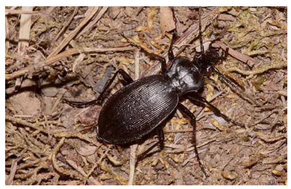
Fig. 8. Carabus (Meganebrius) quinlani smetanai ssp. nov., female in its natural habitat.