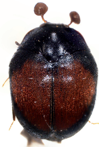
Fig. 7. Habitus of Thaumaglossa rihai Háva, 2002.