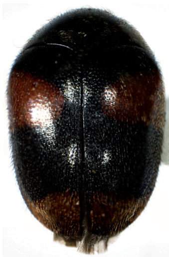
Fig. 6. Habitus of Orphinus (s. str.) thailandicus Háva, 2012.

Distribution. Species recently described from Thailand, new to Laos.