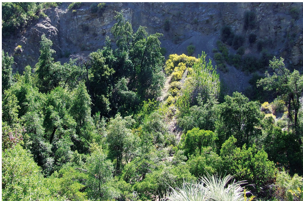
Fig. 5. Type locality. Chile, Región Metropolitana, Provincia Cordillera, Reserva Nacional Rio Clarillo.