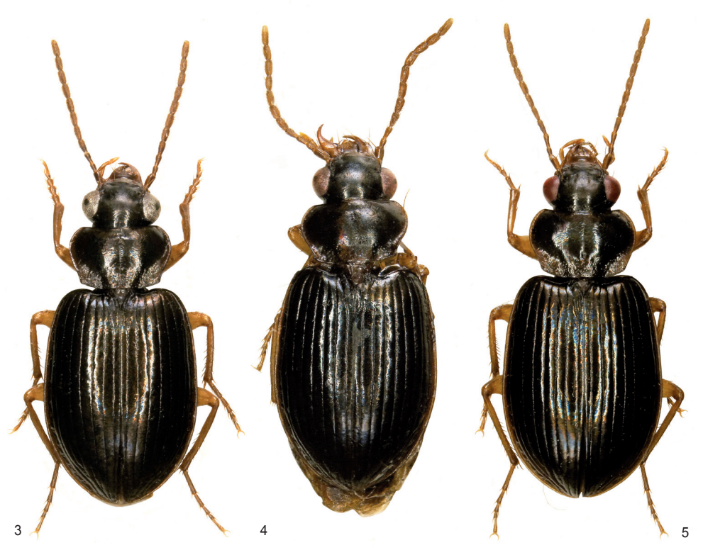
Figs 3-5. Habitus (body lengths in brackets). 3- Arhytinus bastai sp. nov. (5.6 mm). 4- A. cechovskyi sp. nov. (4.4 mm). 5- A. bulirschi sp. nov. (6.9 mm).

pronotum: 1.10; width pronotum/head: 1.38; length/width of elytra: 1.40.