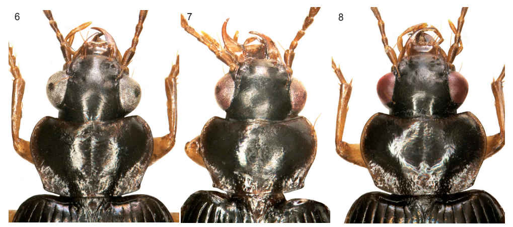
Figs 6-8. Head and prothorax. 6- Arhytinus bastai sp. nov. 7- A. cechovskyi sp. nov. 8- A. bulirschi sp. nov.

Relationships. Doubtful due to the unknown male genitalia. In body shape, except for shape of pronotum, somewhat reminiscent of Arhytinus bembidioides Bates, 1889 and of both other species described in the present paper, but larger in size than all of them.