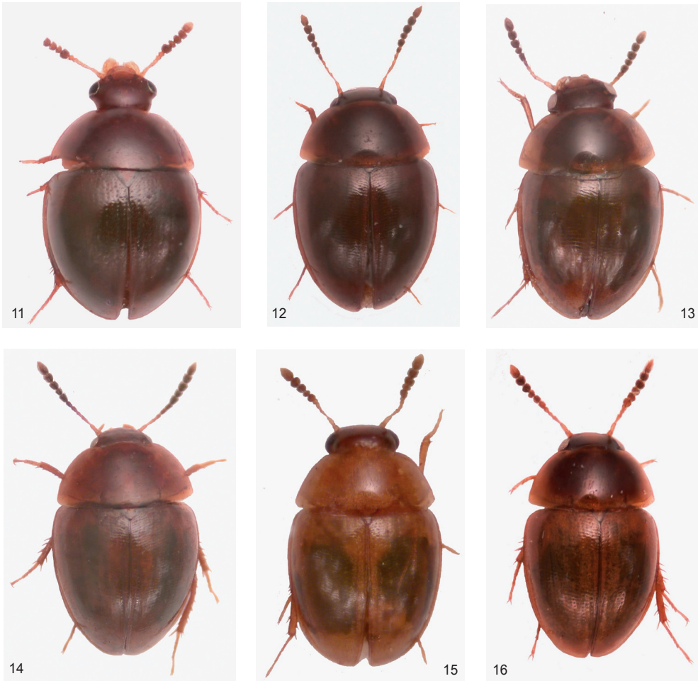
Figs 11-16: Dorsal view of body (holotypes). 11- Pseudocolenis antennata sp. nov., 12- P. appendiculata sp. nov.; 13- P. similis sp. nov.; 14- P. curvipes sp. nov.; 15- P. parva sp. nov.; 16- P. torta sp. nov.

Description. Total length 2.2-2.8 mm, in holotype 2.7 mm, head 0.2 mm, pronotum 1.2 mm, elytra 1.3 mm, antenna 0.9 mm, aedeagus 1.1 mm. Maximum width of head 0.6 mm, pronotum 1.4 mm at base, elytra 1.5 mm at anterior fourth of elytral length.