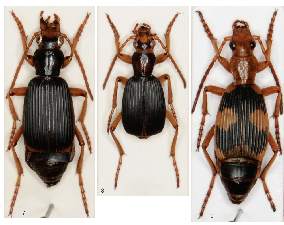
Figs. 7-9. Holotypes: 7- Pheropsophus kabelkai sp. nov.; 8- Pheropsophus jakli sp. nov.; 9- Pheropsophus sonae sp. nov.

Male genitalia (Figs. 3-4). Aedeagus robust and conical. Apical half flattish dorsoventrally. The tip is pointed.