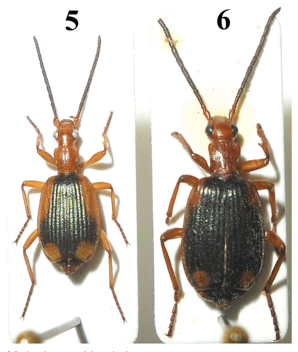
Fig. 5. Brachinus havai sp. nov., holotype, dorsal aspect. Fig. 6. Brachinus tetraspilotus Chaudoir, 1876, dorsal aspect.

Each elytron with 8 imperceptible costae. Posterior margin of elytra concave. Epipleura and lateral margins of the elytra rusty red. Humeral spots elongate (reaching slightly over half of the elytra) and connected with rusty red lateral margins. Apical spots isolated from rusty red lateral margins.