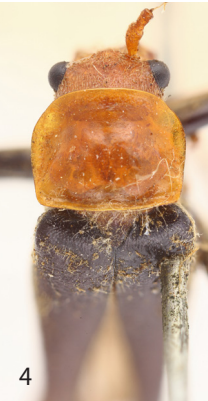
Fig. 2. Dorsal view of a Cantharis fuscipennis specimen (♂) of the Bourgeois collection.