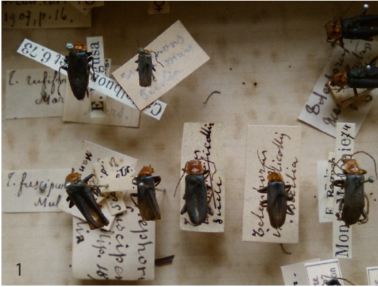
Fig. 1. Overview of specimens of Cantharis fuscipennis (Mulsant) and C. rufifrons (Marseul) of the Bourgeois collection.