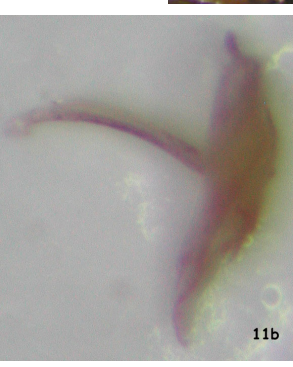
Figs. 5-11. Myrmeanthrenus fasciatus sp. nov.: 5- habitus of male, dorsal aspect; 6- habitus of female, dorsal aspect; 7- antenna of male; 8- antenna of female; 9- head, frontal aspect; 10- abdomen; 11a- male genitalia, dorsal aspect, 11b- median lobe, lateral aspect.

elevated, with a large cavity between the eyes, at the tip of which the ocellus is situated (Fig. 9); finely punctate, with white recumbent setation. Palpi entirely brown. Antennae, brown, with 11 antennomeres, antennal club with 3 antennomeres (Fig. 7), with light brown setation. Pronotum finely punctate like head, covered with brown and white recumbent setation; brown setation covered by disc. Scutellum triangular, finely punctate as pronotum, without setation. Elytra finely punctate, on each humerus with a large bump; cuticle dark brown, covered with brown and white setation. Each etytron with two, transverse, fasciae of white setation (Figs. 5-6). Epipleura dark brown, finely punctate, covered with white setation. Mesosternum and metasternum covered with white setation; metasternum coarsely punctate; prosternal process broad. Abdominal ventrites finely punctate, covered with white, recumbent setation. Abdominal ventrite V with two flat, circular holes. Legs brown, with