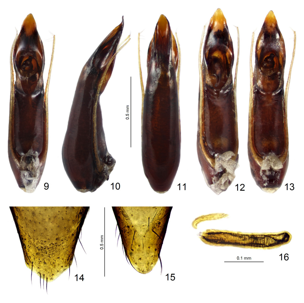
Figs. 9-16: Oreopaederus kibalensis sp. nov., 9-11: HT male; 12, 13- PTs males; 14-16: PT female. 9, 12, 13- aedeagus ventral; 10- aedeagus lateral; 11- aedeagus dorsal; 14- apical part of female sternite VIII; 15- apical part of female tergite VIII; 16- spermatheca.

Male. Labrum slightly emarginate medially, lateral lobes slightly prominent (Fig. 3). Sternite V in apical half with large shallow impression, sternite VI with very narrow and shallow impression, sternite VII in posterior two thirds with distinct narrow longitudinal impression and with slightly emarginated posterior margin, sternite VIII narrowly and deeply emarginate (Fig. 5), tergite VIII narrowly rounded apically (Fig. 6). Aedeagus (Figs. 9-13) length 1.28-1.33 mm (M=1.31 mm, HT=1.28 mm). Median lobe slender, narrowed in two thirds of length, apical third moderately widened with long pointed apex. Apical part of dorsal side of median lobe with two longitudinal ridges (Fig. 11).