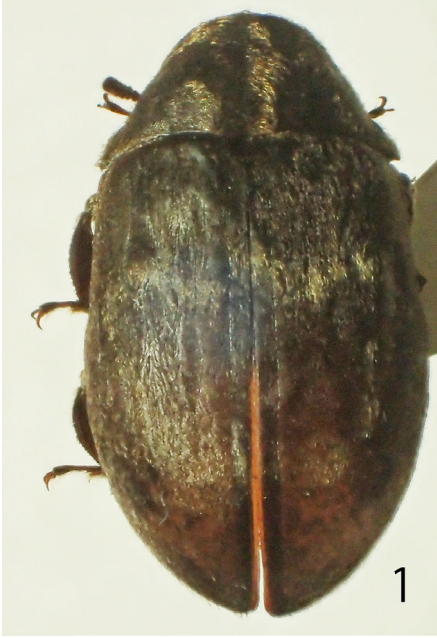
Fig. 1. Habitus of Byrrhus kusakarii sp. nov.

irregularly directed; labrum simply rounded at apex. Antennae 11-segmented: 3 rd 1.5 times as long as 4 th ; last 6 segments forming club; 11 th 1.6 times as long as 10 th . Pronotum highly convex above: anterior angle pointed. Elytra long, moderately convex above, weakly and gently sloping posteriad: sides widest slightly behind the middle; humeral striae irregularly sinuate and contiguous to each other at basal half. Hind wing short, apart from the tip of elytra. Prosternal process widely rounded at apex. Cavity of prosternal process occupying almost all length of mesosternum. Metasternum large, densely punctate, becoming sparser toward longitudinal suture: longitudinal suture short; pleura gently tapering posteriad. Femora and tibiae dilated and flattened; external margin