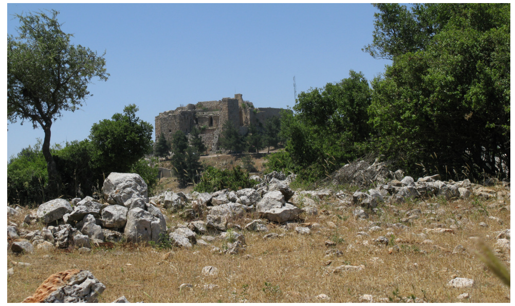
Fig. 9. Type locality of Thorictus stallingi sp. nov.: Jordan, Ajloun.