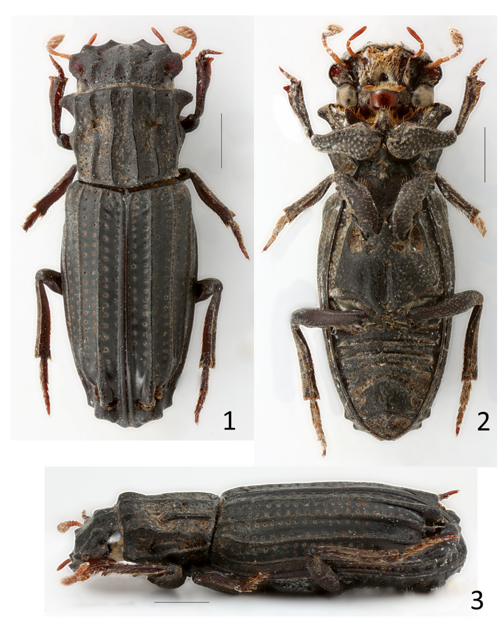
Figs. 1-3. Rhyparus myslenickorum sp. nov., \updownarrow , holotype: 1- dorsal view, 2- ventral view, 3- lateral view. Figs. 1-3: scale lines: 1.0 mm.