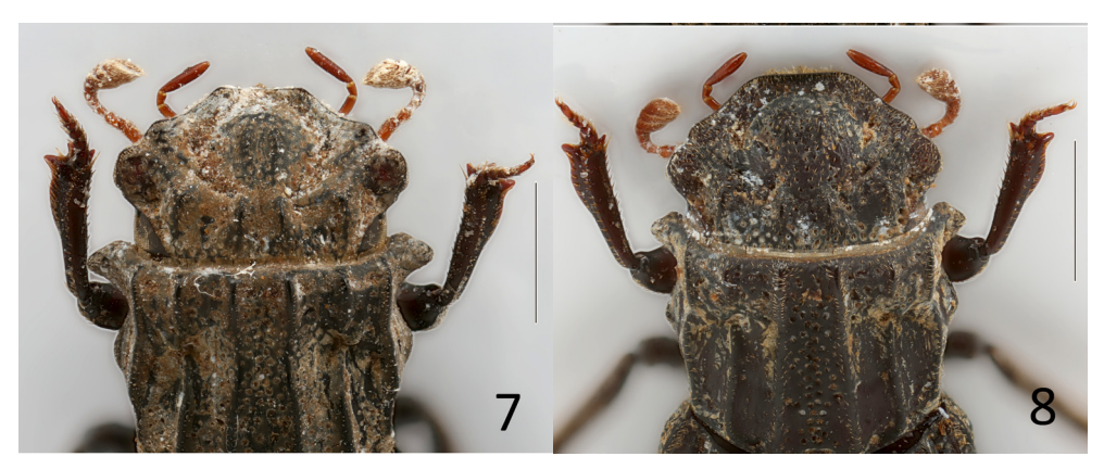
Figs. 7-8. Heads: 7- Rhyparus myslenickorum sp. nov., 8- Rhyparus burckhardti Paulian, 1989. Figs. 7-8: scale lines: 1.0 mm.

ACKNOWLEDGEMENTS. I am grateful to Robert Angus for checking my English. Special thanks go to Cezary Nowak who helped me get material examined in current manuscript.