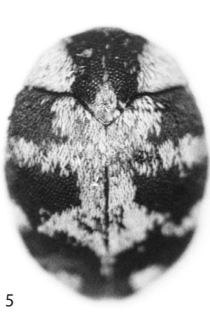
Figs. 4-5. Anthrenus (Nathrenus) perak Háva, 2016: 4- male, dorsal aspect; 5- female dorsal aspect.