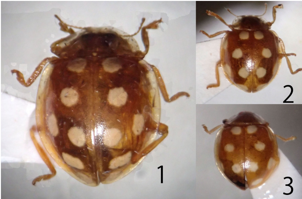
Figs. 1-3. Habitus: 1- Halyzia ichiyanaigii sp. nov.; 2- Vibidia fukudai sp. nov.; 3- Vibidia saitoi sp. nov.