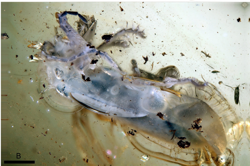
Fig. 1. Lycocerus xenium sp. nov.: Holotype, No. BaA04PL. A: dorso-lateral view; B: ventro-lateral view. Scale bars = 1.0 mm.