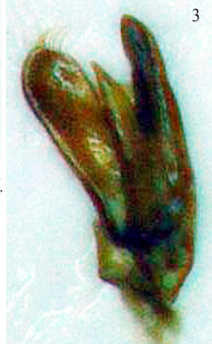
Figs. 1-3. Attagenus novis sp. nov.: 1- habitus, dorsal aspect; 2- antenna of male; 3- male genitalia.