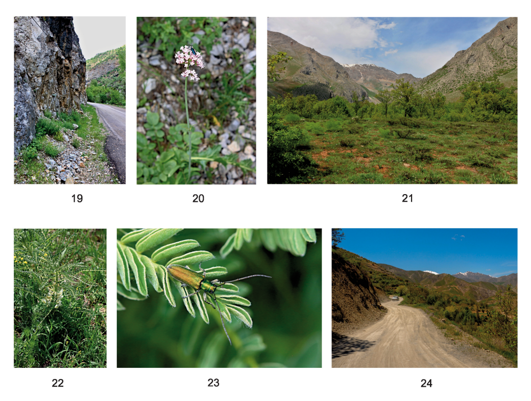
Male genitals. Lateral lobes of tegmen long, basally very broad, with few apical setae. Tegminal strut rather rounded. Penis apically broad, prolonged and well rounded, its dorsal struts rather broad.

Variability. Small variation in metallic lustre of body.