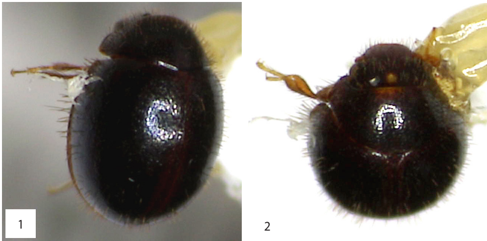
Figs. 1-2. Trinoparvus villosus Háva, 2004: 1- habitus, dorso-lateral; 2- head and pronotum.

Material examined: New Caledonia, 11814, 22°23' S 166°55' E, 50 m, Cap Ndoua, site 2, rainfor., 28-29 Nov.2004, berlesate, G. Monteith, P. Grimbacher / Photog. Spm PS 1419, 2 spec., J. Háva det., (QMBA, MNHN).