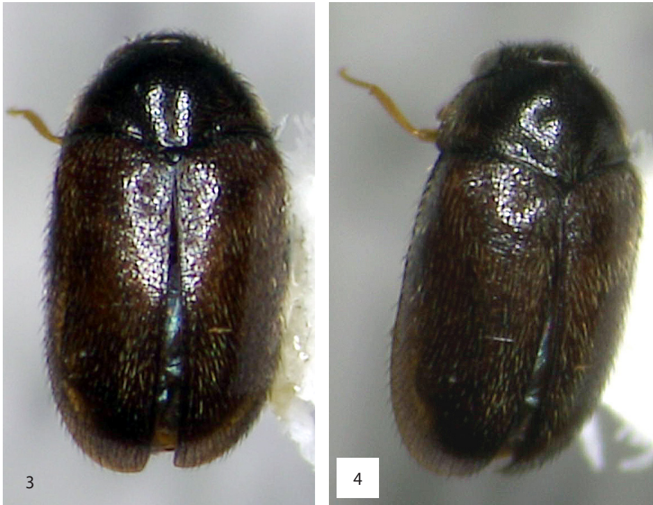
Figs. 3-4. Trogoderma millei Háva, 2013: 3- habitus, dorsal; 4- habitus, dorso-lateral.

Remarks. The species has been still known according to the holotype specimen described from New Caledonia. Second known specimen and new distributional data are considered here.