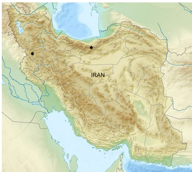
Figs. 3-4. Dermestes (Dermestinus) solskyi Dalla Torre, 1911: 3- habitus, dorsal aspect; 4- known locality in Iran (asterisk - holotype).