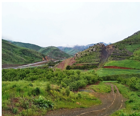
Figs. 1-2. Sampling locality, Iran, Kamyaran, Haltoshan env.