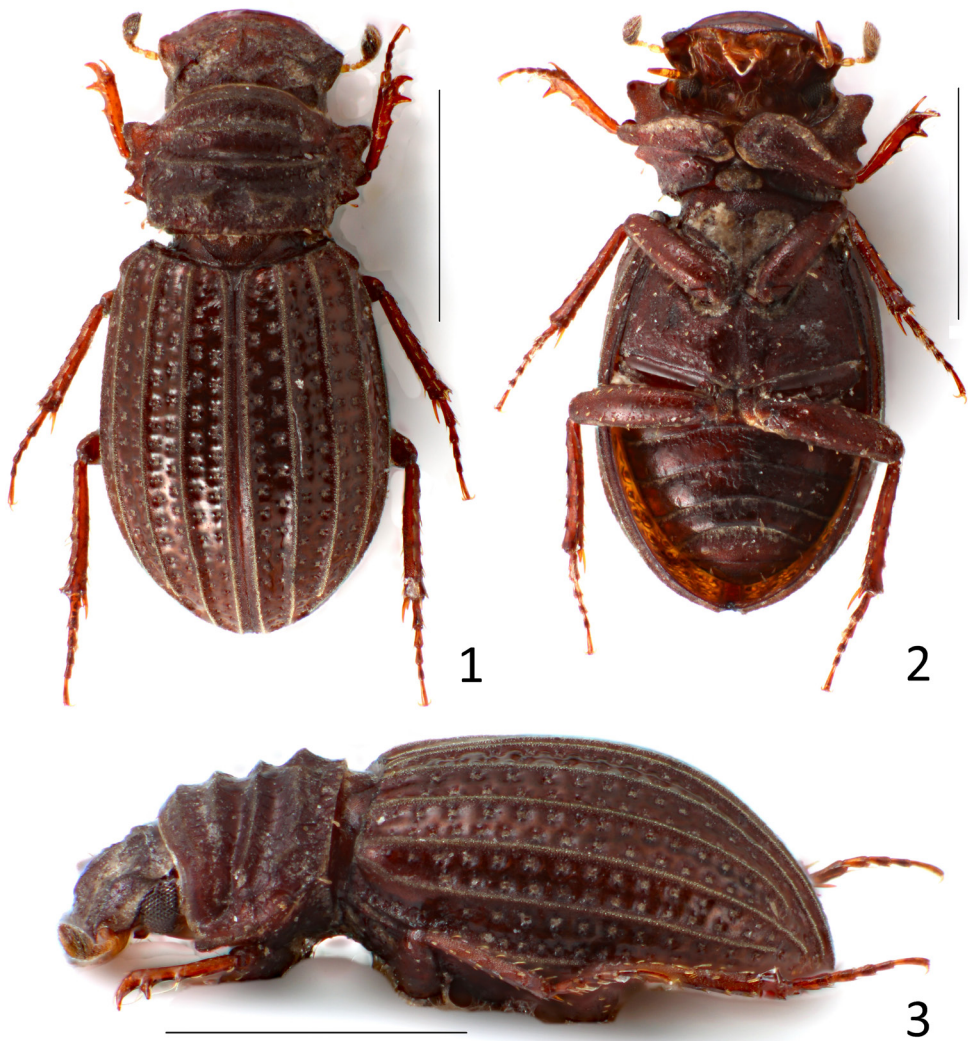
Figs. 1-3. Odochilus (Parodochilus) siberutensis sp. nov., ♂, holotype: 1- dorsal view; 2- ventral view; 3- lateral view. Figs. 1-3: scale lines: 1.0 mm.

very distinctly convex, covered by extremely short, dense, dust-like macrosetae. Intercostae with two rows of coarse, dense, x-shaped punctures.